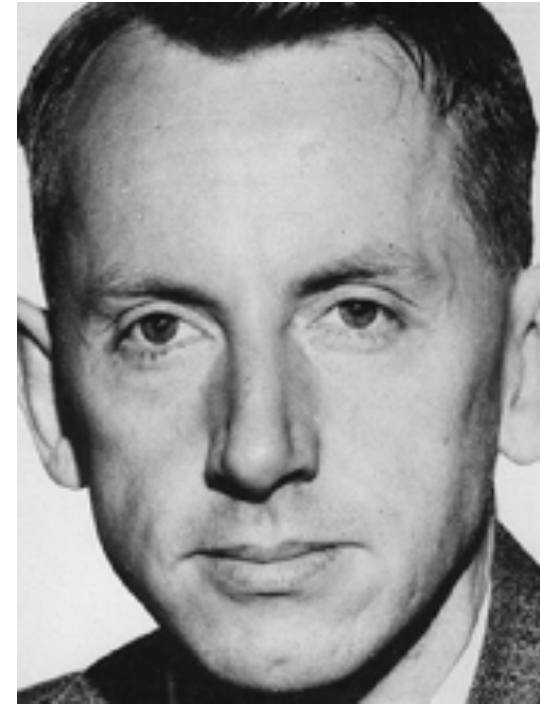
Dr Gilbert Bogle was found to have had a number of extramarital affairs.

But there was more: some 18.5 metres away in a shallow depression on the edge of the river the body of a woman was found under a few sheets